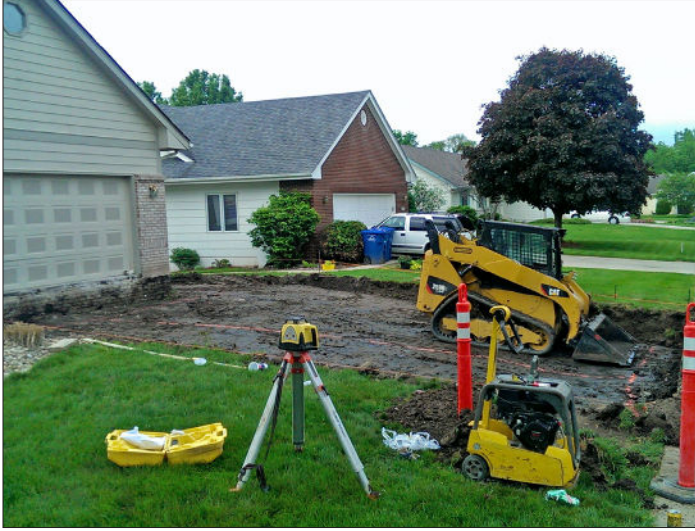
Step 1 Removal of concrete and excavation