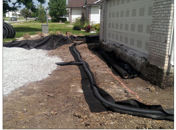
Step 2 Installation of perforated subdrain tile