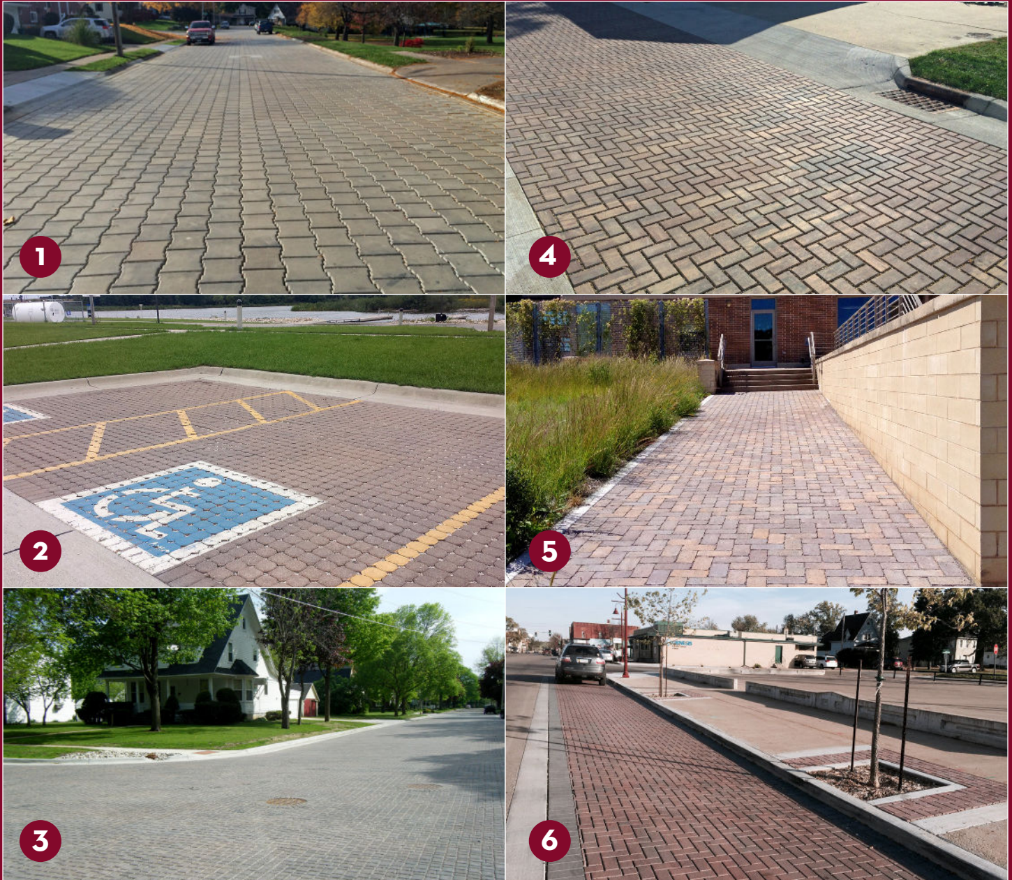
1 Davenport - Residential Street