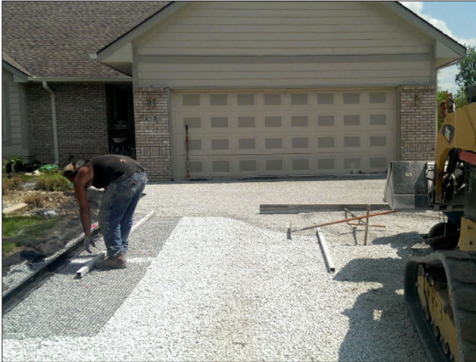
Step 3 Leveling and compacting aggregate