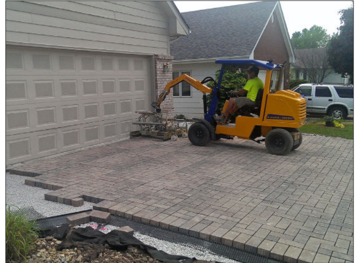
Step 4 Laying pavers