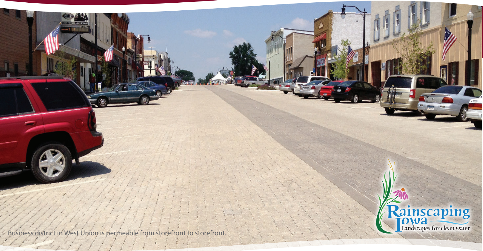
Business district in West Union is permeable from storefront to storefront.